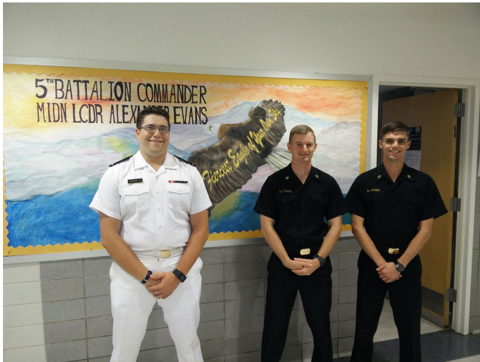
Figure 3: Team H.A.N.D. excited to begin work!